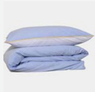
LIGHT BLUE STRIPE YELLOW PIPING

SIZES 140X200/140X220/150X210/200X- 200/200X220/220X220/240X220