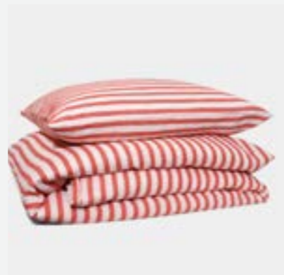
RED LINEN STRIPE

SIZES 140X200/140X220/150X210/200X- 200/200X220/220X220/240X220