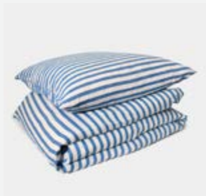
BLUE LINEN STRIPE

SIZES 140X200/140X220/150X210/200X- 200/200X220/220X220/240X220