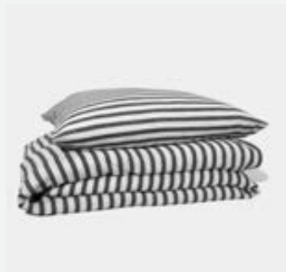
BLACK LINEN STRIPE

SIZES 140X200/140X220/150X210/200X- 200/200X220/220X220/240X220